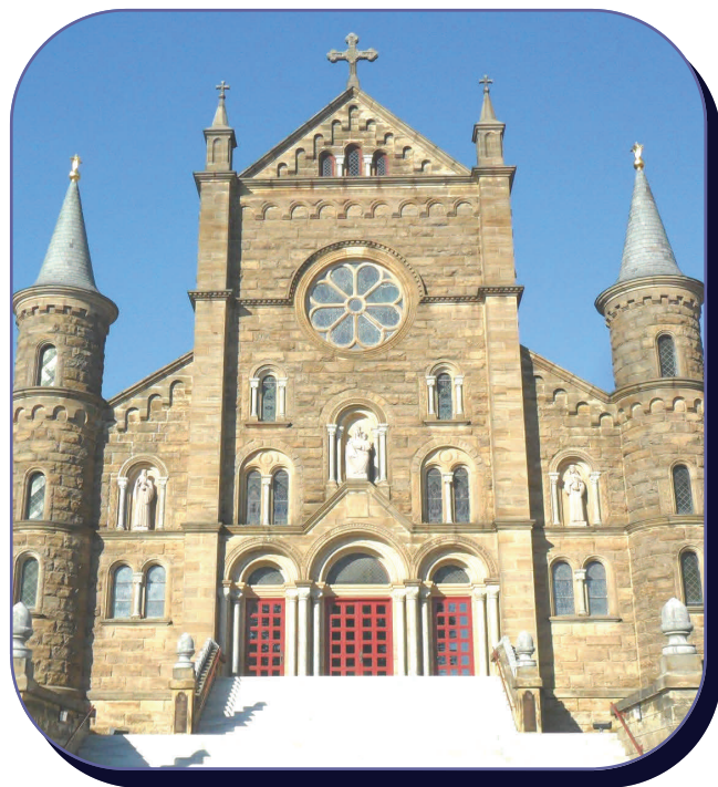
Our Lady of Einsiedeln Archabbey Church