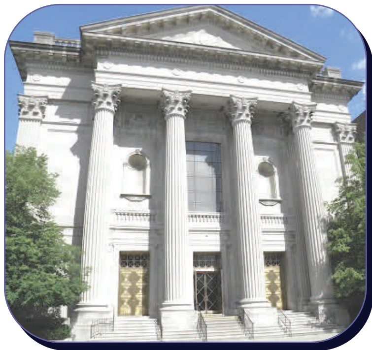
Ss. Peter and Paul Cathedral

The Holy Door at Saints Peter and Paul Cathedral in Indianapolis will be opened on Sunday, December 13, 2015 at a special Mass beginning at 10:30AM. A Holy Door will also be opened at the Archabbey Church of Our Lady of Einsiedeln in St. Meinrad, Indiana. Throughout the Holy Year these doors will stay open during the Cathedral’s and Archabbey’s regular hours until they are ceremonially closed on November 13, 2016. All are invited to make a pilgrimage to the Cathedral or the Archabbey Church to walk through the Holy Doors in order to fulfill part of the requirements of the special Plenary Indulgence available during that time.